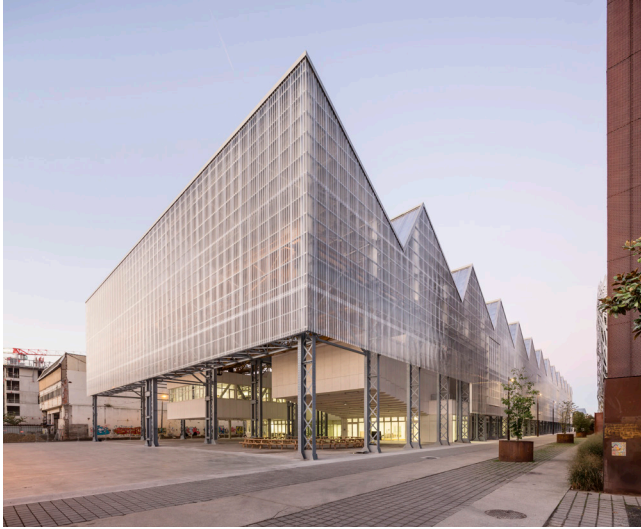
Left: Beaux-Arts Nantes Saint-Nazaire. Architecture Franklin Azzi. right: Views of the workshops.