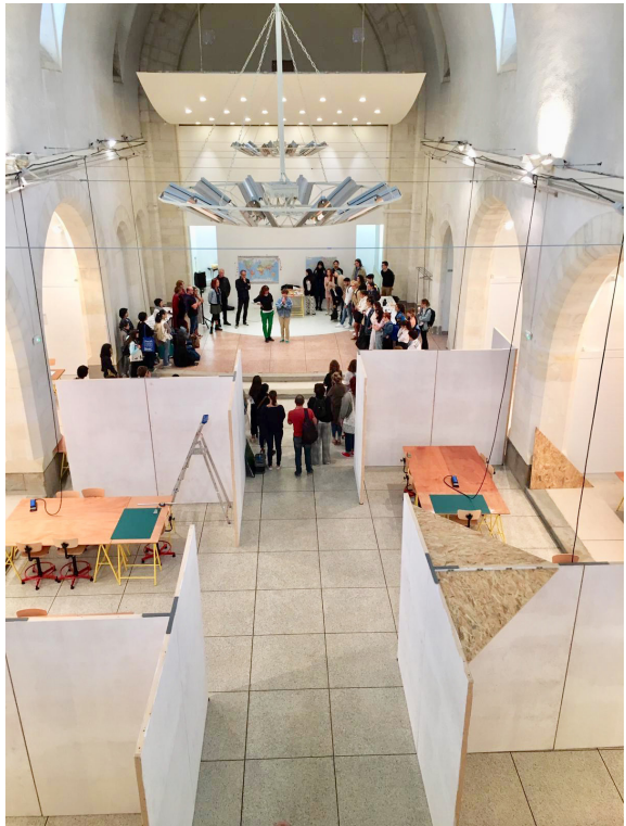
Back to school at the Ateliers de l'Estuaire 2019. Chapelle des Franciscains, Saint-Nazaire.