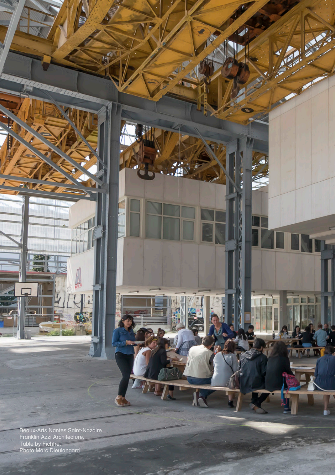
Beaux-Arts Nantes Saint-Nazaire. Franklin Azzi Architecture. Table by Fichtre.