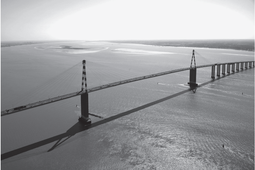
Saint-Nazaire bridge